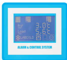
Hygienic touch screen controller

Ideal for A&E, Maternity, Community Hospitals, and Hospices etc, fitted with a Dual Compressor to ensure greater temperature control and peace of mind in the event of failure of one of the systems. Each complete refrigeration system provides 100% performance, sufficient to cool down and maintain temperatures correctly without help from the second compressor.